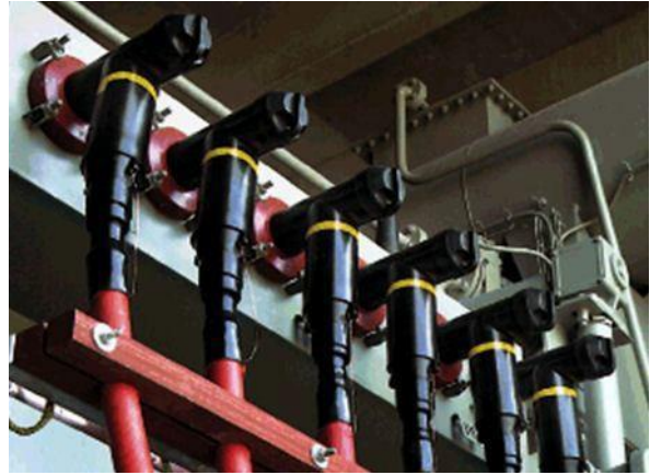
Typical Capacitive Test Point